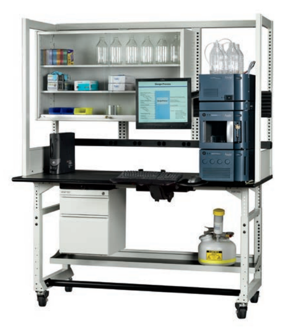
Strong, durable, modular steel TechOrganizer over heavy-duty TechBench provides stability for technology-intensive environments including instrumentation chemistry.

Analytical, computer and electronic labs require technical furniture that is flexible, rugged and ergonomically designed. Eaton's LMS and TechBench lines offer a wide variety of workstation surfaces and components for placement of computers, test equipment and instrumentation, along with a complete line of ESD controls.