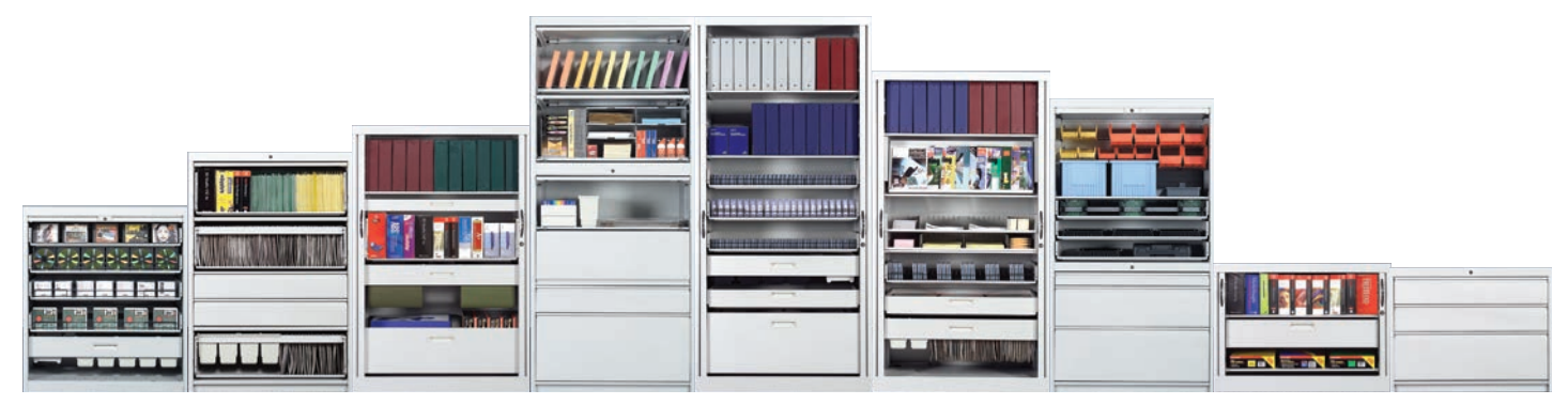
Optimedia cabinet choices include eight heights, four door closure options, seven colors and more than one hundred media-specific components.