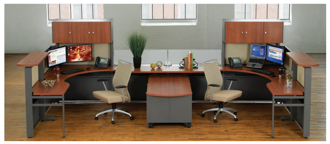
Eaton wall panels are easy to install and reconfigure if panels need to be added or changed at a later date.

With unlimited design possibilities, Eaton modular desk systems provide the perfect balance of privacy or employee interaction. Your Eaton representative will help you choose the right combination of walls, worksurfaces, storage solutions and accessories to create your high-performance workstation.