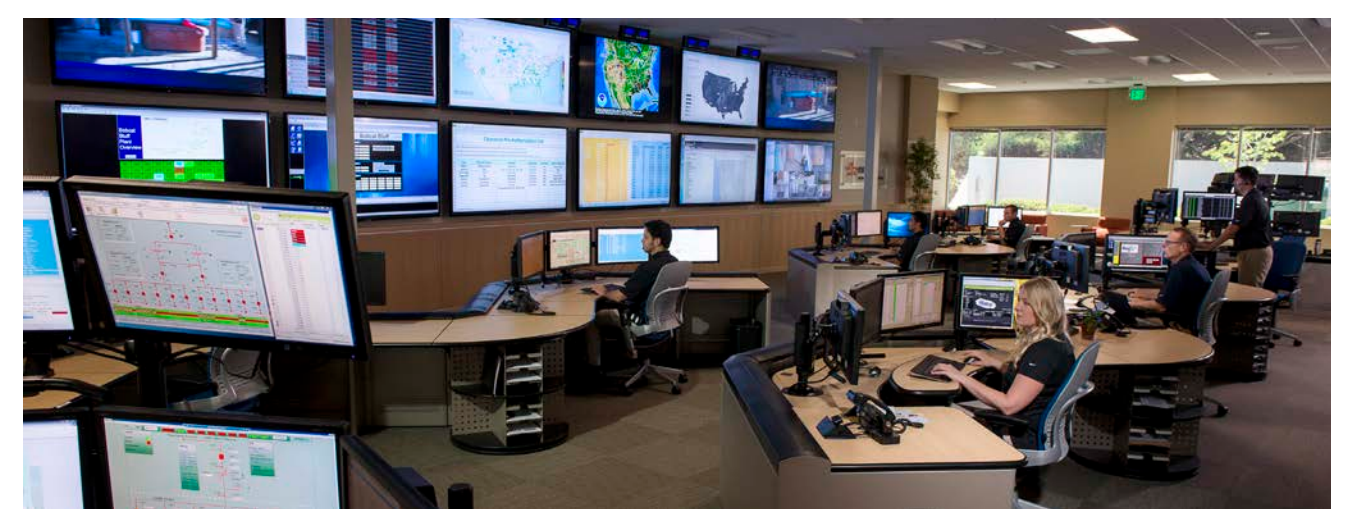
Profile's core connector permits a variety of angled configurations from comfortable cockpit viewing of monitoring equipment to shared workstation platforms. Profile provides electronic or manual height-adjustable work surfaces for sit-to-stand applications, as well as superior power and cable management for easy service access.

In mission-critical monitoring environments, such as control rooms and network operations centers, optimal situational awareness and precise data interpretation are essential. The design of an operator's workspace is directly related to the ability to perform to the standards required. Eaton's high-performance, modular command consoles help improve operator's access to equipment, sitting position and sight lines while helping reduce potential risk of repetitive stress injury.