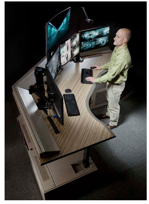
Eaton's OnGuard command console maximizes user comfort, safety and efficiency with features like electronic height-adjustable worksurfaces and personal storage and filing options, with fully extending drawers.