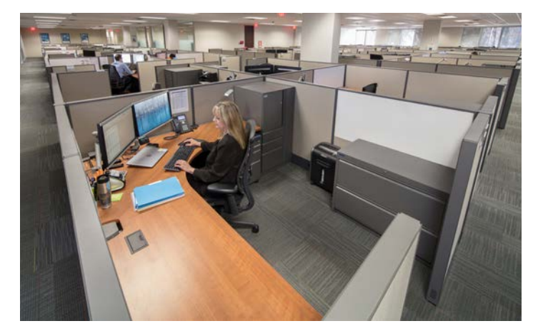
A variety of wall options are available to help provide privacy and sound dampening in open office environments.