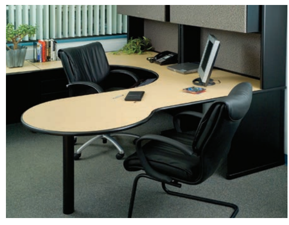
LINX freestanding worksurfaces and modular storage walls are easily reconfigured to any environment and technology.