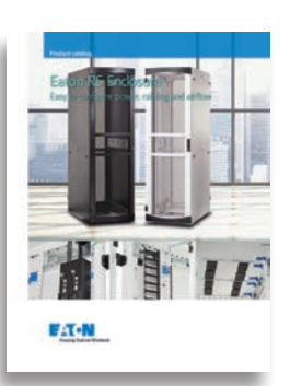
Eaton RS enclosure system catalog