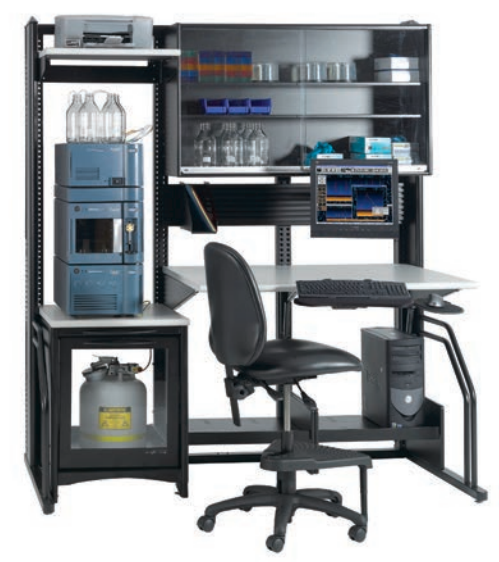
Over one thousand components allow for unlimited reconfigurability of your technical furniture, creating a completely modular system that permits an unlimited array of equipment and instrumentation.

Analytical, computer and electronic labs require technical furniture that is flexible, rugged and ergonomically designed. Eaton's LMS and TechBench lines offer a wide variety of workstation surfaces and components for placement of computers, test equipment and instrumentation, along with a complete line of ESD controls.