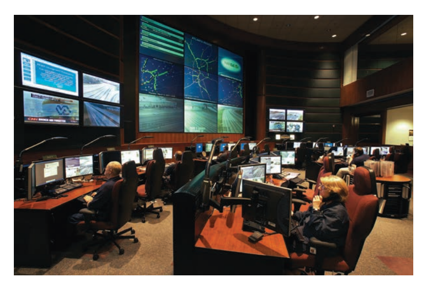
At the Georgia Department of Transportation, single-tier Profile consoles were configured in a 15° concave fashion providing clean sight lines to wall-mounted plasma monitors and a central video wall.