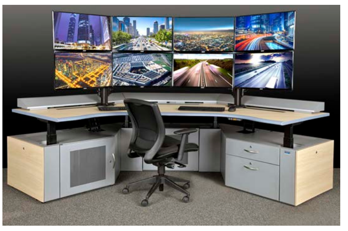
The OnGuard console's easy to adjust monitor positioning allows an infinite number of options to adjust for personal comfort and changing business needs.

Eaton's ergonomic command console lines (Profile and OnGuard) are specifically constructed to withstand the rigors of 24/7 multi-shift environments such as 9-1-1 call taking, dispatch and help desks. Our innovative and reconfigurable workstations feature electric, height-adjustable worksurfaces, integrated flat panel display arms and accessories.