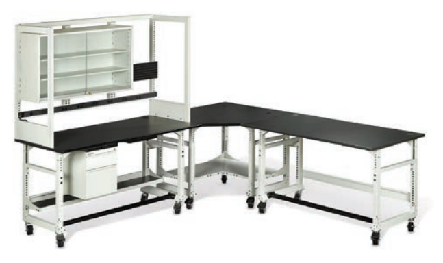
Add a corner TechBench to maximize space utilization and create a continuous workspace.