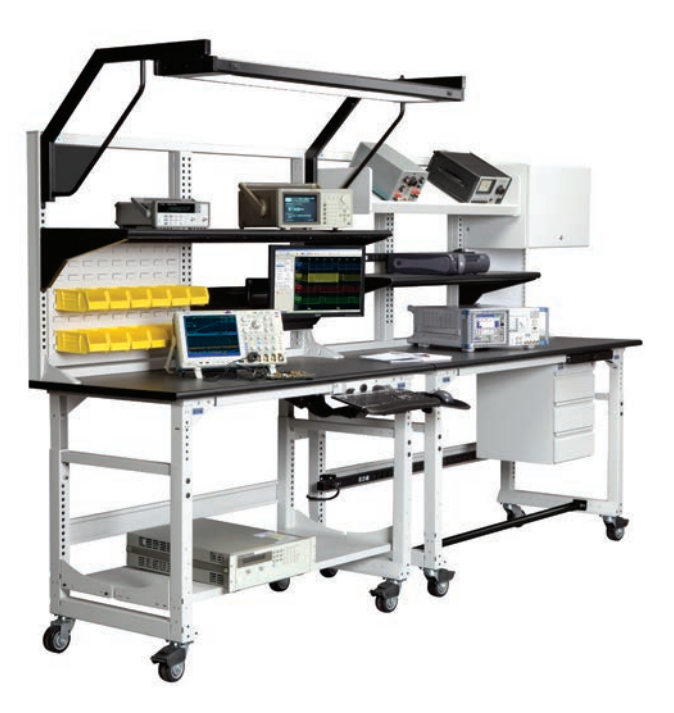
The solidly constructed TechBench system provides unmatched modularity for analytical, engineering, light manufacturing, testing and assembly environments.

Eaton's workbench systems for electronic environments provide heavy-duty support of equipment above and below the benchtop. This is important in applications where results are dependent on a stable test and inspection environment.