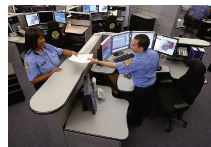
Reception counters provide efficient interaction between City of Miami supervisors and call center personnel.