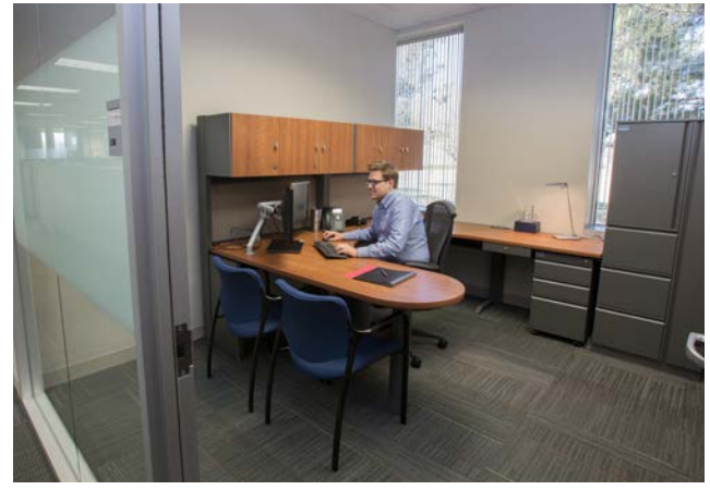
The Compass system is equally suited for private office environments. Aesthetically and functionally adaptable, the Compass system can integrate into any room's architecture.