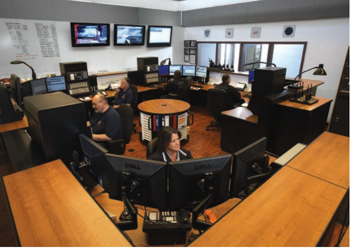
The Profile Command Console comes in a variety of finishes to complement your work environment. This four-person dispatch configuration was finished in black steel with cherry laminate tops to coordinate with the center's wood flooring.