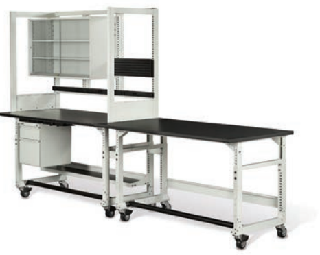
Link multiple linear TechBenches to form a continuous worksurface in larger open spaces.

Linear configurations for basic requirements.