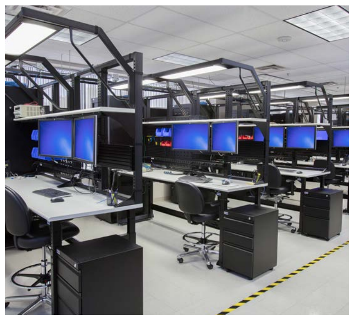
TechBench<sup>™</sup> and TechOrganizer<sup>™</sup> create a dynamic system that integrates people with technology, maximizes useable workspace and contributes to highly effective and efficient workflow.

Eaton's workbench systems for electronic environments provide heavy-duty support of equipment above and below the benchtop. This is important in applications where results are dependent on a stable test and inspection environment.