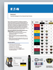
Weatherhead® Tool & Die Packages for Core Hydraulic Hose Products