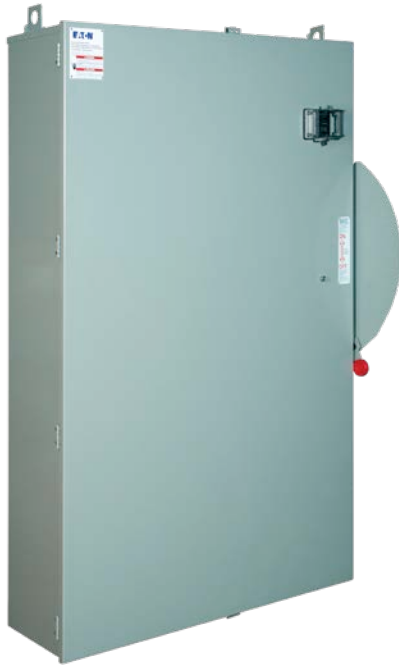
1200 A shunt trip switch with integrated ground fault relay and sensor

Eaton's tried and true heavy-duty safety switch line expands to include shunt trip capability—remote switching and visible means of disconnect for commercial and industrial applications.