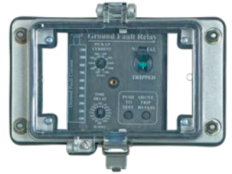
Integrated ground fault module, complete with viewing/access window available on 400–1200 A switches