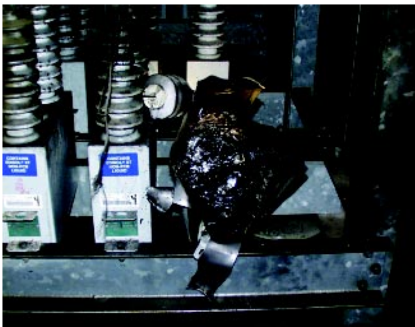
Blown capacitor cans are just one possible outcome of harmonic resonance.

Harmonic resonance. The operation of non-linear loads in a power distribution system creates harmonic currents