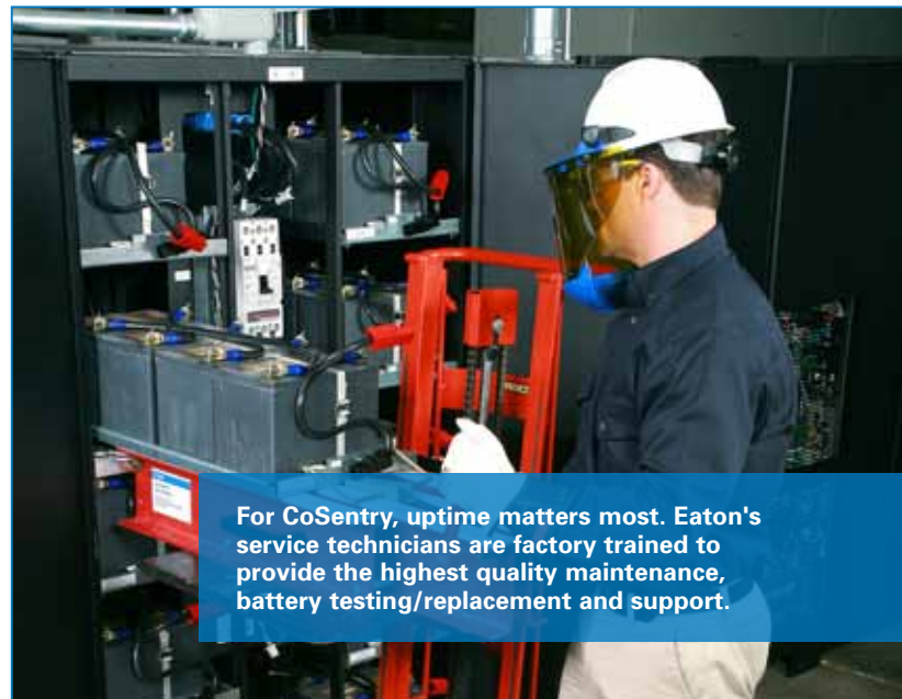
For CoSentry, uptime matters most. Eaton’s service technicians are factory trained to provide the highest quality maintenance, battery testing/replacement and support.