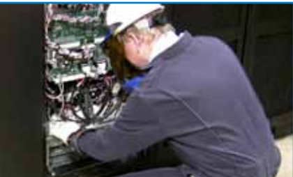
The 9395s modular design lets service technicians disconnect one UPM while the remaining UPMs support the load.