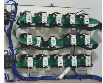
After SmartWire-DT—pilot devices connected with the flat cable wiring solution.

Eaton 1000 Eaton Boulevard Cleveland, OH 44122 United States Eaton.com