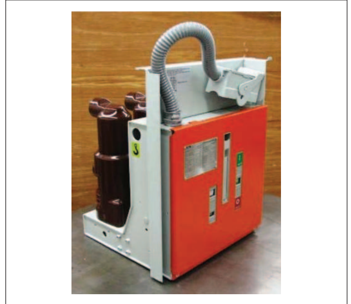
Figure 7. New Design Fixed-Mount Vacuum Circuit Breaker Applied in 1.2 kV Low Voltage and up to 24 kV Medium Voltage Underground Mining Systems

The impact of these changes in underground electrical systems is an upward pressure on circuit breaker designs. MCCBs that have been applied at 1000 Vac with full load current ratings of 150, 250, 400, 600, 1200, and 2000A with interrupting current ratings from 10 kA to 25 kA are now being used to operate at higher operating voltages from 1.2 kV up to 3.3 kV with interrupting ratings to 25 kA and beyond. Circuit breaker manufacturers are pushing the limits of MCCB design. MCCBs employ arc interruption in air via a proven technology that draws an arc developed across opening contacts into an arc-chute that divides the arc into several smaller components, eventually cooling and extinguishing it to interrupt a fault. Higher rating requirements are pushing the physics of the ability to successfully interrupt an arc in air. This opens the door to other circuit interruption methods including vacuum and SF 6 designs that must be considered. Figure 7 shows one available vacuum circuit breaker, a new design presently being introduced into underground mining applications.