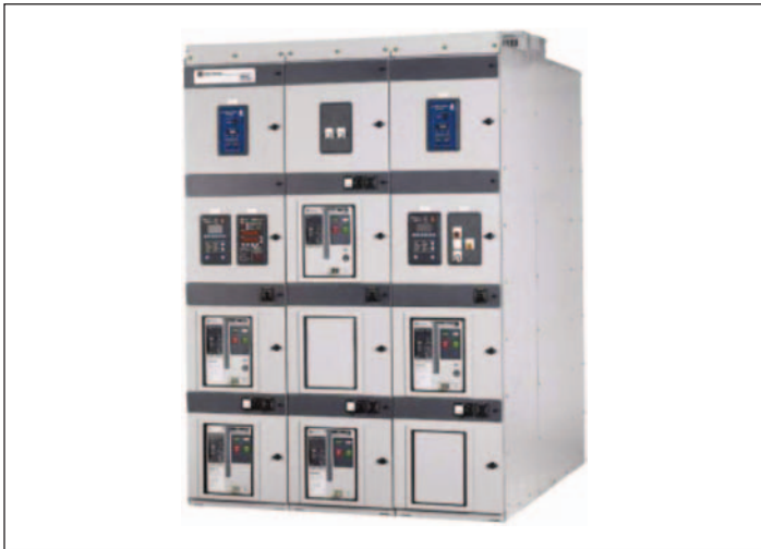
Figure 1. Low Voltage Metal-Enclosed Switchgear Manufactured to ANSI/NEMA Standard C3720.1

In this case, ANSI/NEMA Standard C3720.1 [2] dictates the design and test requirements for this assembly, including low voltage power circuit breakers that are manufactured and tested to a similar standard. This assembly can also include an arc-resistant rating when it is manufactured to another “adjacent” test standard, ANSI C3720.7 [3]. This standard defines design and testing requirements to ensure an arc-flash event is channeled or redirected up and away from personnel working on or near the assembly while it is energized.