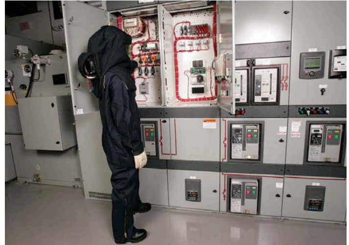
Worker wearing PPE inspecting low-voltage switchgear