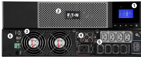
Eaton 5PX 3000i RT2U