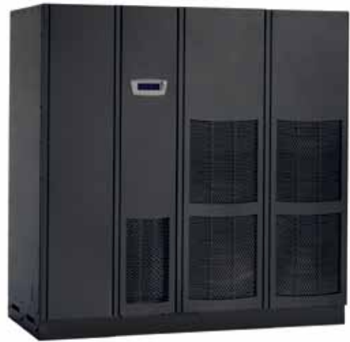
Eaton 9395 550 kVA UPS

They have extensive experience with data centres and are experienced with low and medium voltages. The good maintenance contracts and attractive prices which we agreed for the whole project testify to this. The positive experiences we have had at this centre form an excellent prelude to establishing another twin data centre here in Hengelo."