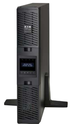
Mount the UPS in a rack or use the included tower stands for vertical placement.