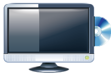
Home Office $1,700