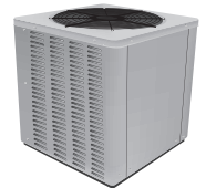
Air Conditioners $4,000