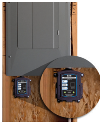
Externally mounted surge protection option