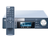
Stereo Systems & Entertainment Centers $1,400