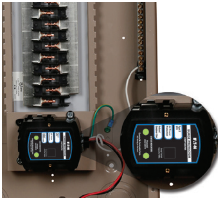
Integral surge loadcenter