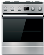
Electric Ranges $1,000