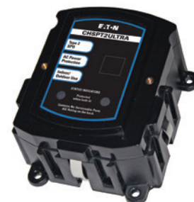
Complete Home Surge Protector (Externally mounted to your breaker box)