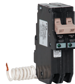
Complete Home Surge Circuit Breaker (Internally mounted to your breaker box)