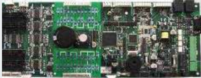
Universal controller board

Add Eaton Energy Management System upgrade for branch circuit monitoring capabilities to existing PDU and RPP units.