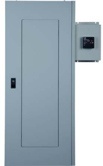
SPD series side-mount surge protective device providing superior retrofit surge protection.

Regardless of the way the SPD series device is installed, four feature packages are available: