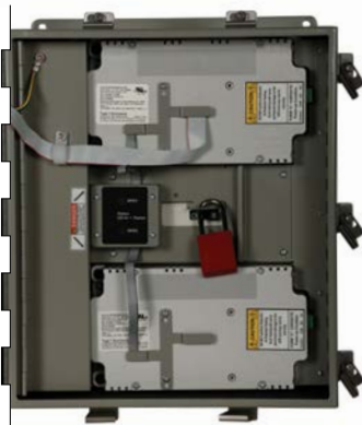
SPM series devices include industry exclusive barriers and lockout provisions to mitigate arc flash exposure.