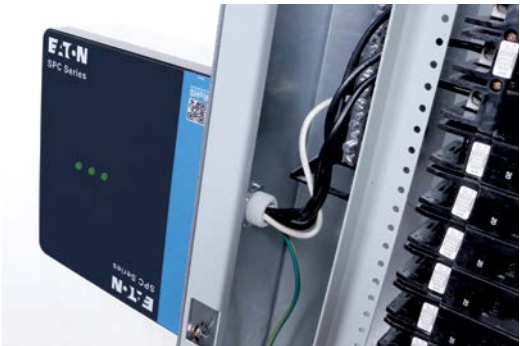
The SPC series can be easily close-coupled to distribution equipment, keeping the connected lead length short for maximum performance.