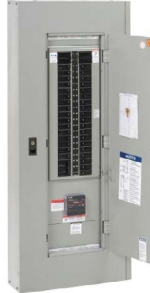
SPD series unit installed in a panelboard, providing optimum surge protection without the need for an additional enclosure.