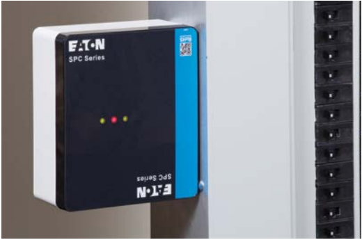
Tri-colored protection status indicators show the results of continuous self-diagnostic testing.