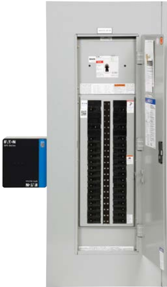
Panelboard with side-mount SPC series surge protective device.