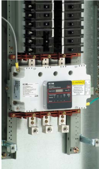
Mounting a surge device directly to the panelboard's bus bars provides the best possible protection by minimizing the let-through voltage.

Side-mount models are compact in size and allow for installation as close as possible to the protected equipment. This keeps conductor leads short—but not as short as with an integrated assembly.