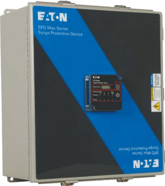
SPM series surge protective device with patented display technology.

The SPD Max series (SPM series) offers innovative, side-mount surge protective devices providing maximum safety, flexibility and protection from the dangers of transients. It's ideal for feeder tap rule applications or when a modular design is required.