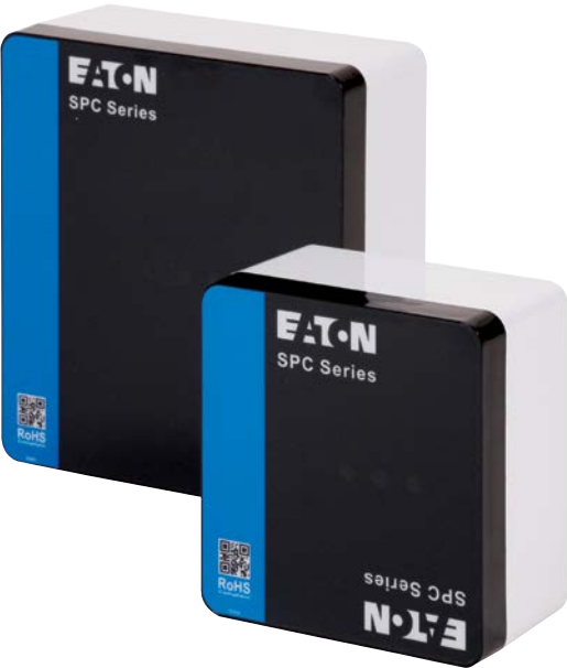
SPC series surge protective devices.

The SPC series offers robust protection in a compact, flexible design configurable for a wide range of applications. It meets standard industrial specifications and can be configured based on your specific requirements.