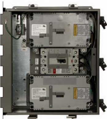
Separate wireways for incoming power cables and surge module wiring allow easy access for installation and flexibility with wire sizes from #10 to 1/0.