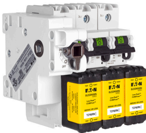
3-pole 60 A CCP shown with left through-the-front rotary operator.

Multi-wire lugs mount in switch box lug terminals to provide additional wire ports per pole.