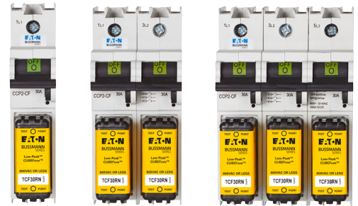
1-, 2-, and 3-pole CCP2-30CF