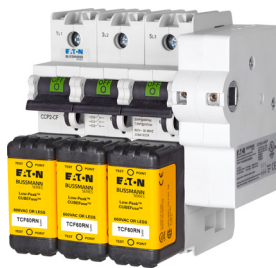
3-pole 60 A CCP shown with right through-the-side rotary operator.