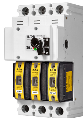
3-pole 400 A CCP shown with front through-the-door rotary operator.