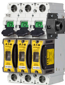
3-pole 200 A CCP shown with right through-the-side rotary operator.