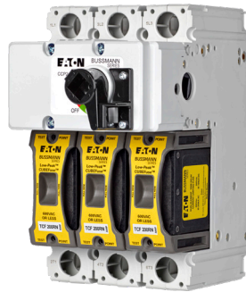
3-pole 200 A CCP shown with front through-the-door rotary operator.