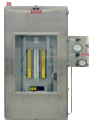
18 Branch position QSCP

Class I, Division 2 enclosures can feature a pressure regulator and pressure switch designed to meet or exceed NEC NFPA 70, NFPA 496 and IEC 60079-02 requirements.