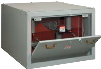
Tilt-Out Fuse Unit