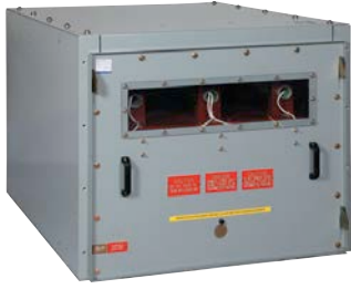
38 kV VT Module