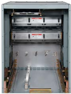
38 kV Breaker Mini Module