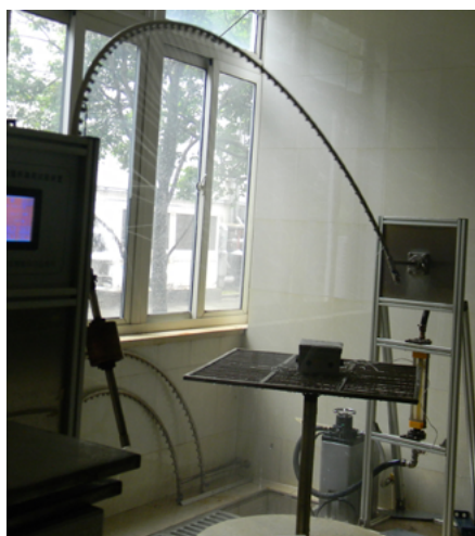
Figure 3. HTB panel mount fuse holders mounted in enclosure and tested to IPx3 conditions at 60 degrees from horizontal

Eaton Electronics Division 1000 Eaton Boulevard Cleveland, OH 44122 United States Eaton.com/electronics