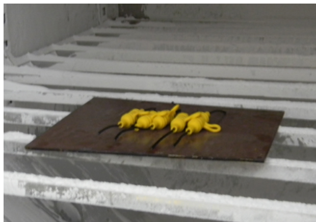
Figure 1. HFB-R with specified wire, installed per specification, tested under IP6x test conditions