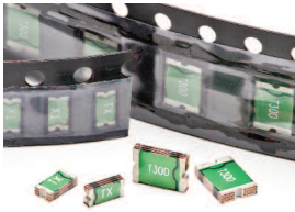
Surface mount PTC device competitive cross reference* guide