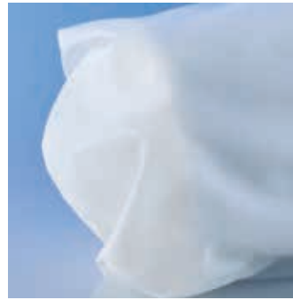
Optional polyamide 6.6 mesh cover in 10 µm forms a protective outer shield