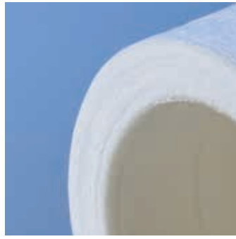
Graded media structure yields gradual loading