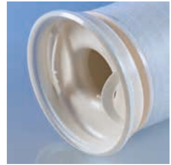
Bypass-free sealing through SENTINEL seal ring