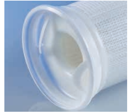
Bypass-free sealing through SENTINEL seal ring