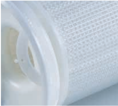
Strong cage supports the filter element during harsh conditions