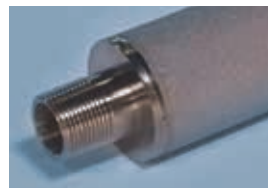
Code M1 and M2: Single open end (SOE) with 3/4" male NPT threaded end (Code M1) respectively 1" male NPT threaded end (Code M2) (only LOFMET)