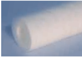
Code (): Double open end (DOE) without end caps (only LOFTREX and LOFTOP)