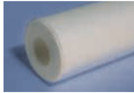
Code G: Double open end (DOE) with foamed Polypropylene flat gaskets (only LOFTREX and LOFTOP)