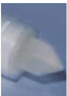
Code 3: Single open end (SOE) with double bayonet adapter (2-226 O-ring) and end cap with fin