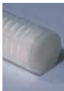
Code 4: Single open end (SOE) with adapter (2-222 O-ring) and flat end cap