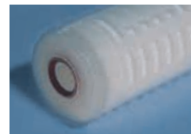
Code 10 and 20: Double open end (DOE) with internal O-ring (Code 10); Single open end (SOE) with internal O-ring (Code 20)