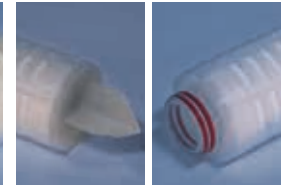
Code 2: Single open end (SOE) with adapter (2-222 O-ring) and end cap with fin