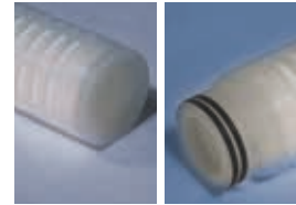
Code 1: Single open end (SOE) with double bayonet adapter (2-226 O-ring) and flat end cap