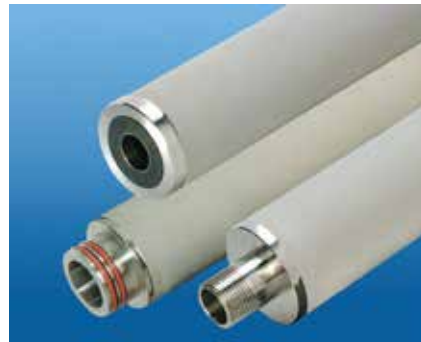
LOFMET filter cartridges are available with a variety of gasket and end cap configurations.

North America 44 Apple Street Tinton Falls, NJ 07724 Toll Free: 800 656-3344 (North America only) Tel: +1 732 212-4700