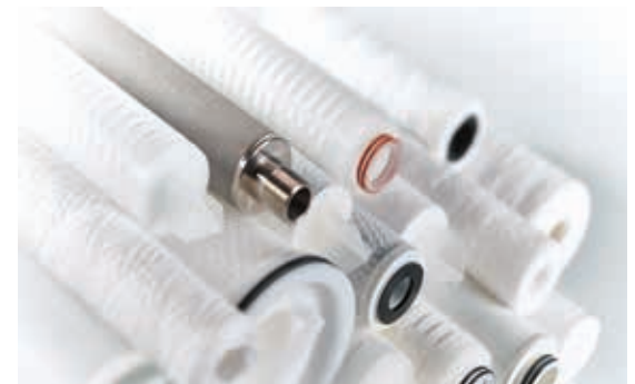
Read more on the success story of metal parts cleaning on www.eaton.com/filtration

Eaton's industrial process filter cartridges provide consistent, high performance and cost-effective solutions for both common and more challenging industrial applications, varying from pre-filter for high purity water up to final filtration for paints and lacquers, or total filtration for various chemicals.