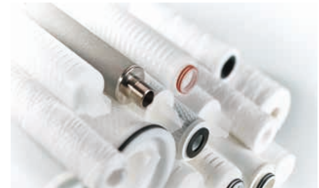
Read more on industrial filter cartridges on www.eaton.com/filtration

Eaton's industrial process filter cartridges provide consistent, high performance and cost-effective solutions for both common and more challenging industrial applications, varying from pre-filter for high purity water up to final filtration for paints and lacquers, or total filtration for various chemicals.