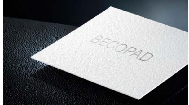
Water throughput BECOPAD P range

BECOPAD P depth filter medium is cationic. It is therefore characterized by charge-related adsorption during filtration. Additionally, the filter medium has a very low content of soluble ions, especially of calcium, magnesium and aluminum. The chemical resistance and bursting strength is extremely high.