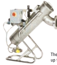
The MCS-500 can process up to 110 m 3 /h

The MCS-1500 is a high-volume system with a flow rate of up to 340 m 3 /h.