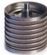
The disc cleaned Model DCF, MCF and MCS require the use of a slotted wedgewire design. Ratings of 15 to 1,600 microns are available.

Ratings from 2 to 1,650 microns are available.