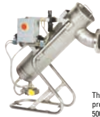
The MCS-500 can process up to 500 gpm

The MCS-1500 is a high-volume system with a flow rate of up to 1500 GPM.