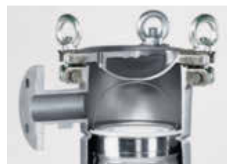
Compression bag hold down creates 360 degree sealing between filter bag and bag filter housing