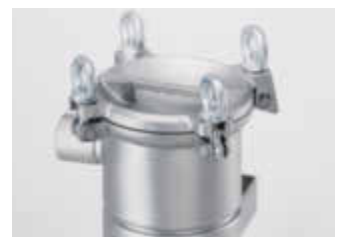
Ergonomic, integral cover handle is easy to open and close