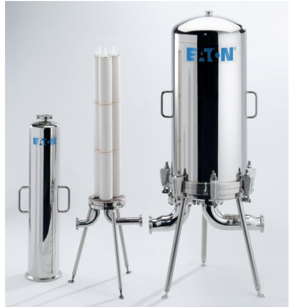
KB housing: 1 to 8 filter cartridges (quick closure)