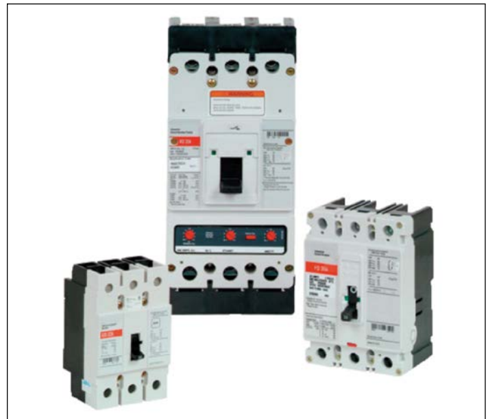
Figure 3. Molded case switching mechanisms are ideal for loads up to 1000 A that require a compact, high-capacity transfer switch with built-in fault protection