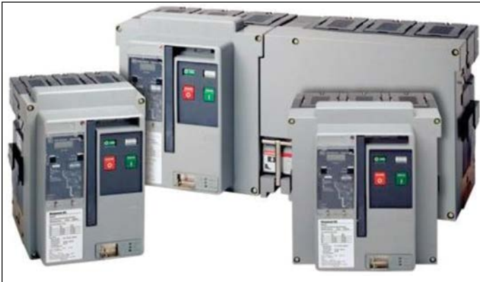
Figure 4. Power case switching mechanisms are available up to 5000 A and offer the highest withstand close-on rating of any switching mechanism type