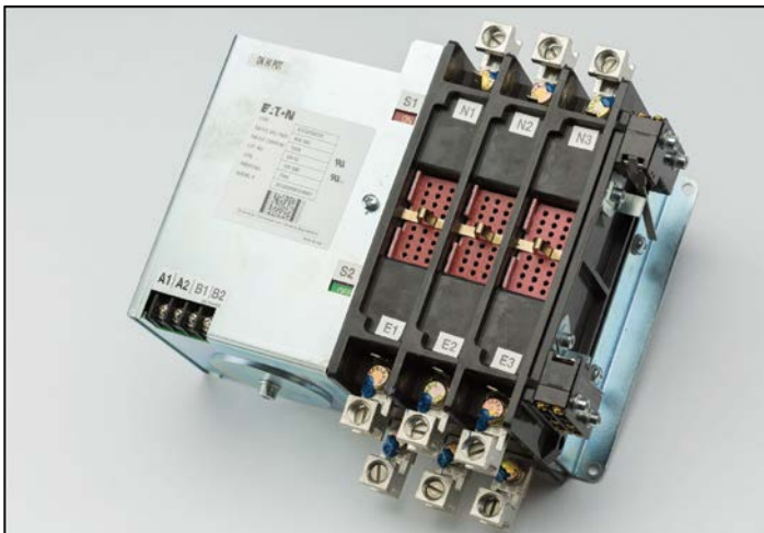
Figure 2. Contactor switching mechanisms are fast and flexible, but don't offer overcurrent protection