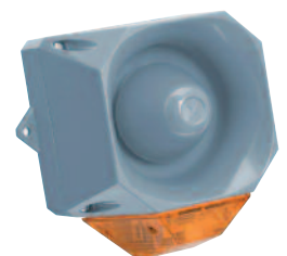
Asserta Midi Sounder Beacon Grey