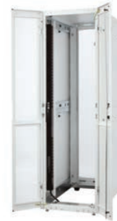
Run your cables through the top or bottom of the enclosure