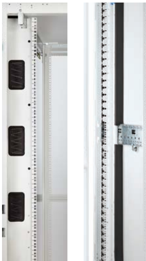
800 mm (31.5 in) 600 mm (23.6 in)

Full front doors feature a 77 percent open perforation pattern for maximum air intake and exhaust. Doors can easily and toollessly be removed.