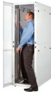
Drop in your PDU

Quickly install and adjust brackets for full- or half-height rack PDUs. The enclosure's seamless integration with Eaton ePDU™ G3 rack power distribution units makes installation easy.