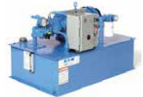
PSGC Green System