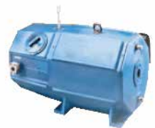
PSMP IMP and Motor pump