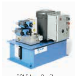
PSLP Low Profile