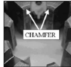
Figure 2. Dies with a CHAMFER use the “P” locators.