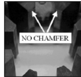
Figure 1. Dies with NO CHAMFER use the “standard” locators.

Using the chart on the front of this bulletin, match the proper locator and die cage. When examining the dies, place the front of the die cage down. The individual dies must be examined to determine if the “standard” (example: 4S6) or “P” style (example: 4S6P) should be used, as shown in Figures 1 and 2.