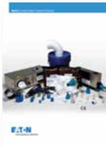
Hose Cleaning Systems E-HOIN-TT032-E2