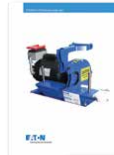
Hydraulic Hose Saws – ET9100 E-EQSW-BB001-E