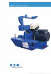
Hydraulic Hose Saws – ET9300 E-EQSW-BB001-E