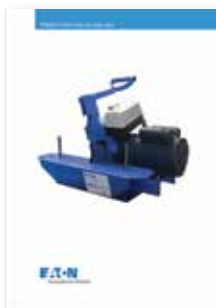
Hydraulic Hose Saws – ET9200 ET9200-10-220 Hydraulic Hose Saw April 2015