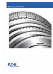
Hydraulic Hose Blades E-EQSW-BB004-E

Eaton Hydraulics Group 14615 Lone Oak Road Eden Prairie, MN 55344 USA Tel: 952-937-9800 www.eaton.com/hydraulics