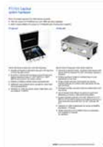
Hose Capping Systems E-HOIN-TT032-E2